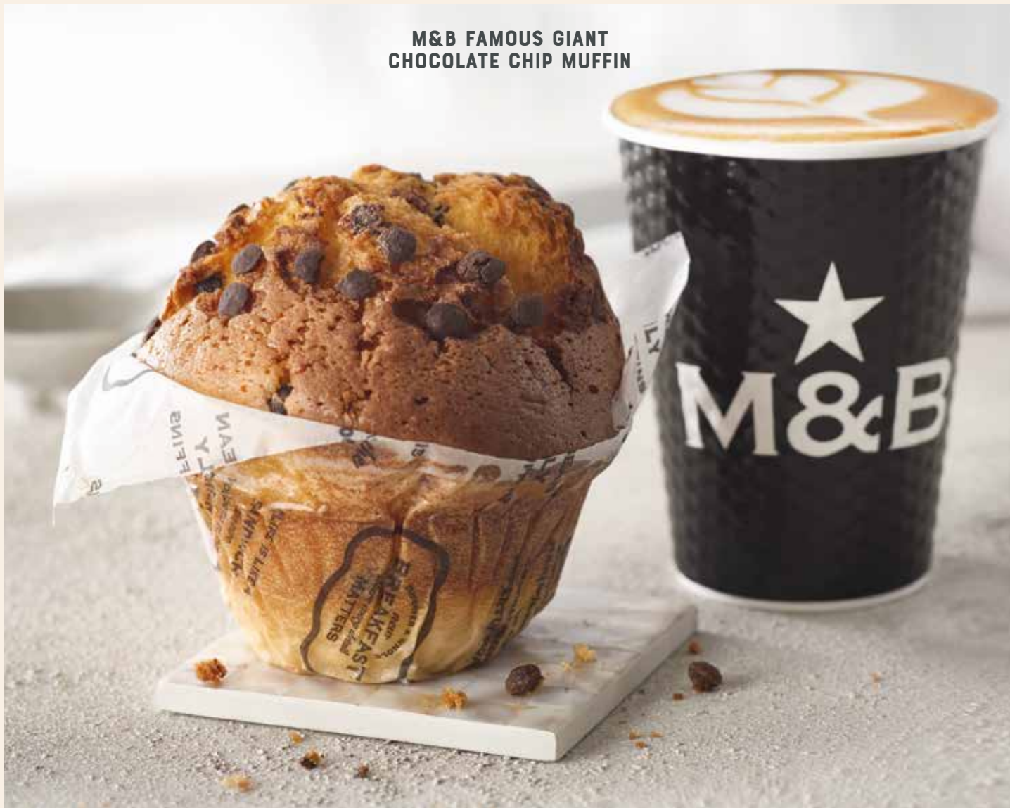
M&B FAMOUS GIANT CHOCOLATE CHIP MUFFIN