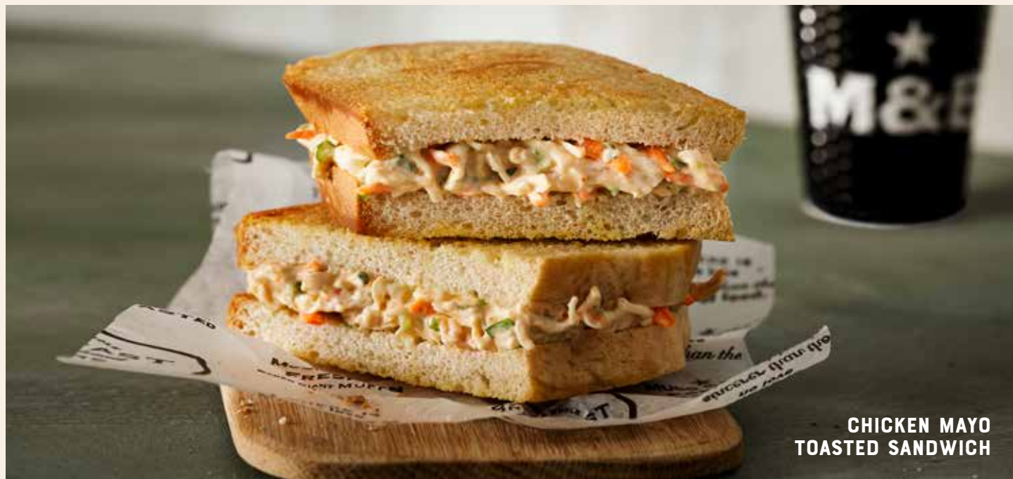
CHICKEN MAYO TOASTED SANDWICH