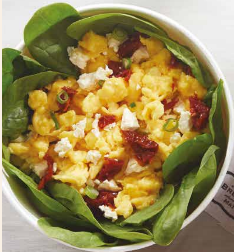
BABY SPINACH, FETA & SUN-DRIED TOMATO