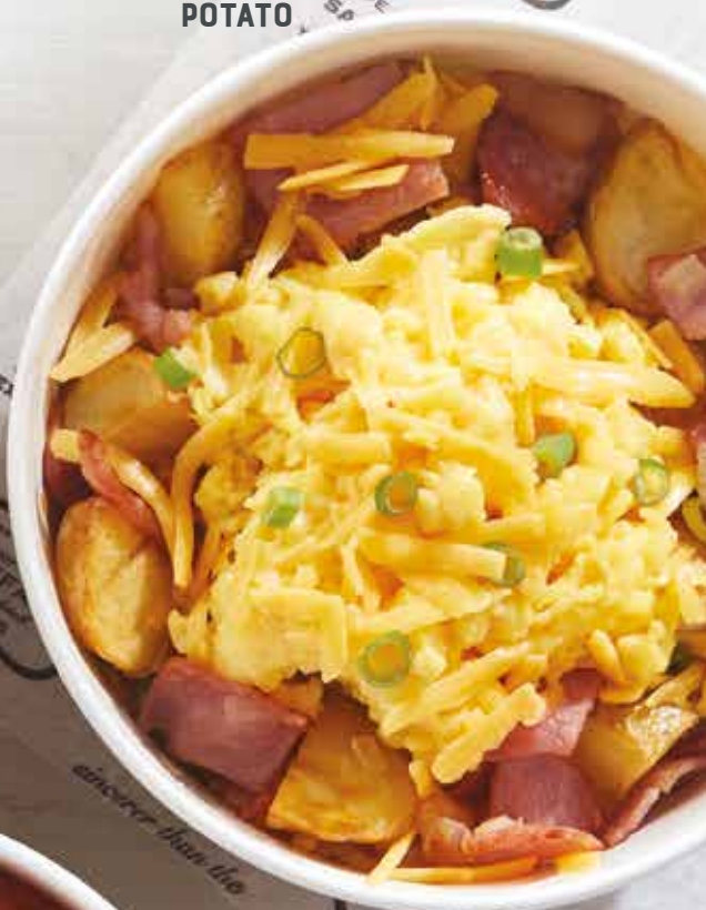
BACK BACON, CHEDDAR & POTATO